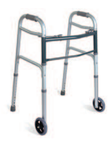
MPRL0603 (Adult) MPRL0602 (Child) MPRL0601 (Paed) Aluminium adjustable 2-pin foldable rollator