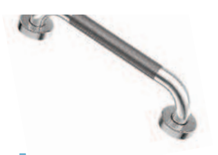
MPBA0301/0302 12"/16" chrome-plated support bars