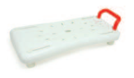
MPBA0330 Across bath board Max weight 150kg