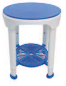
MPBA0343 DIY plastic stool