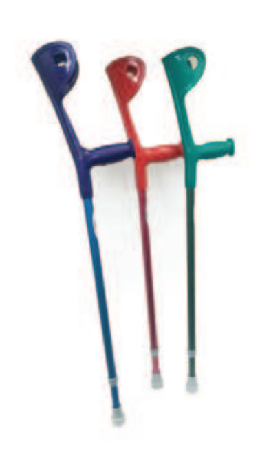
MPCR0174 Smart crutch, available in blue, red and green