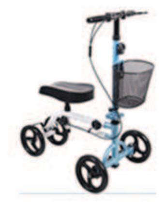
MPWA0997 Knee support walker Max weight 100kg