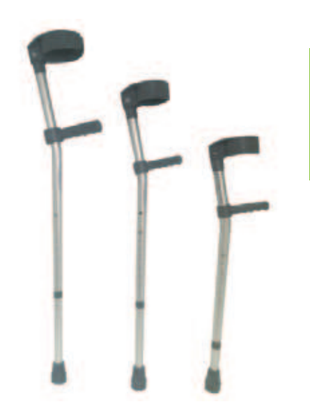
MPCR0153 Aluminium adult elbow crutch, available in blue, green and red